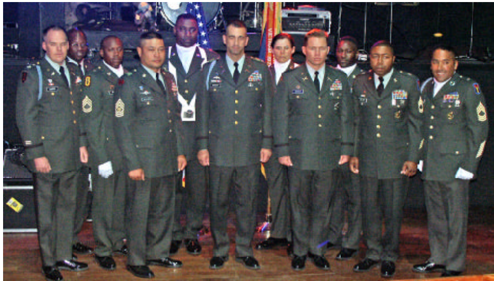
Officers and NCOs from the active duty 196th brought the Brigade's Colors from Hawaii.