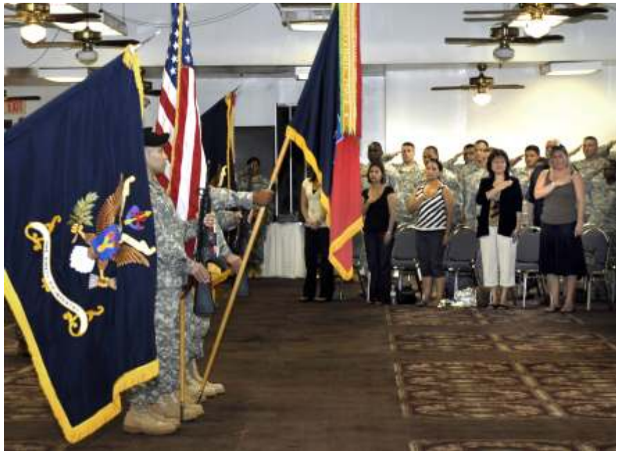
Families of the 196th Brigade stand at attention during ceremonies activating the Headquarters and Headquarters Company (Provisional)