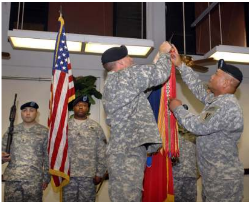
Army Superior Award Streamer

In addition to activating the new company, the 196th Infantry Brigade added a streamer to it’s flag as it received an Army Superior Unit Award for outstanding meritorious service in support of the Global War on Terrorism from Jan 2004 to Apr 2007 ... and the unit’s professional, high-quality and responsive support to civilian authorities, reserve and active component units, according to the award orders.