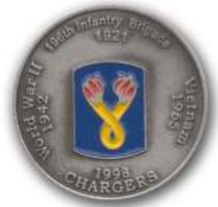
196 th CHALLENGE COIN